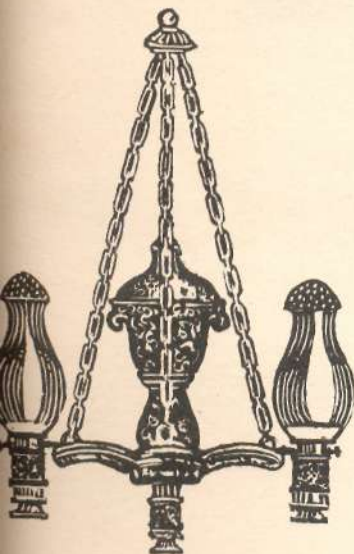
PATENT DIAMOND HANGING LAMP.

An Order for payment on some person in England must please accompany orders sent home, the Prices being so low that an account cannot be afforded.